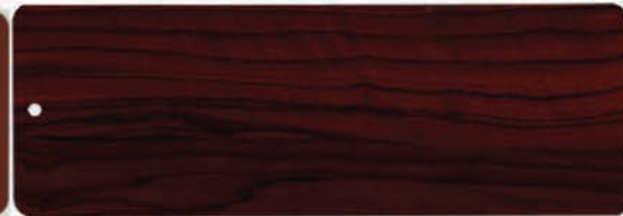
DS 406F + 2903/05